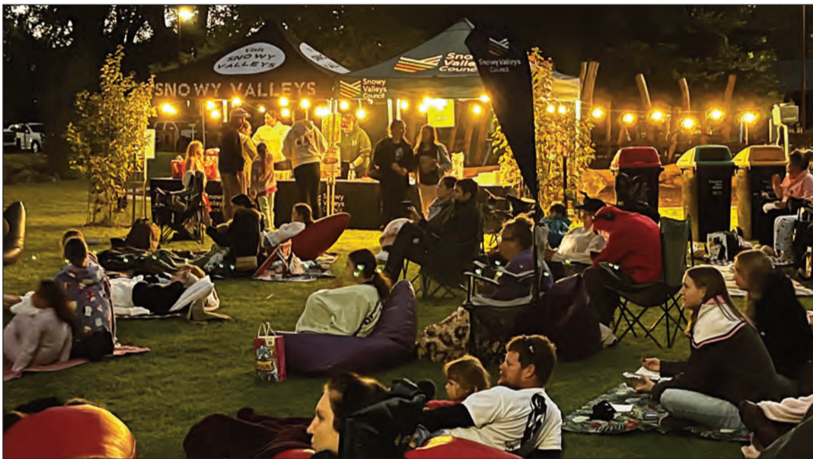
Crowd enjoying the night, the ambience, and the movie.

Under clear skies, the Snowy Valleys community gathered at Tumut Rotary Pioneer Park for Council's first Pop-Up Outdoor Movie, delivered by the Youth Council.