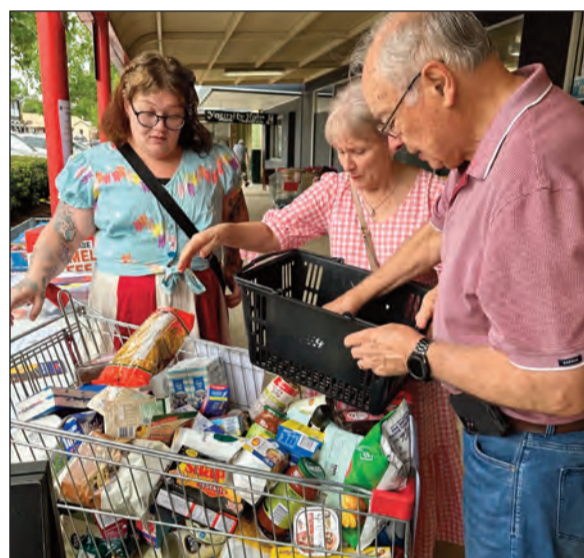
The last Lions Club Trolley Drop drew plenty of donated groceries for those doing it a bit tough.