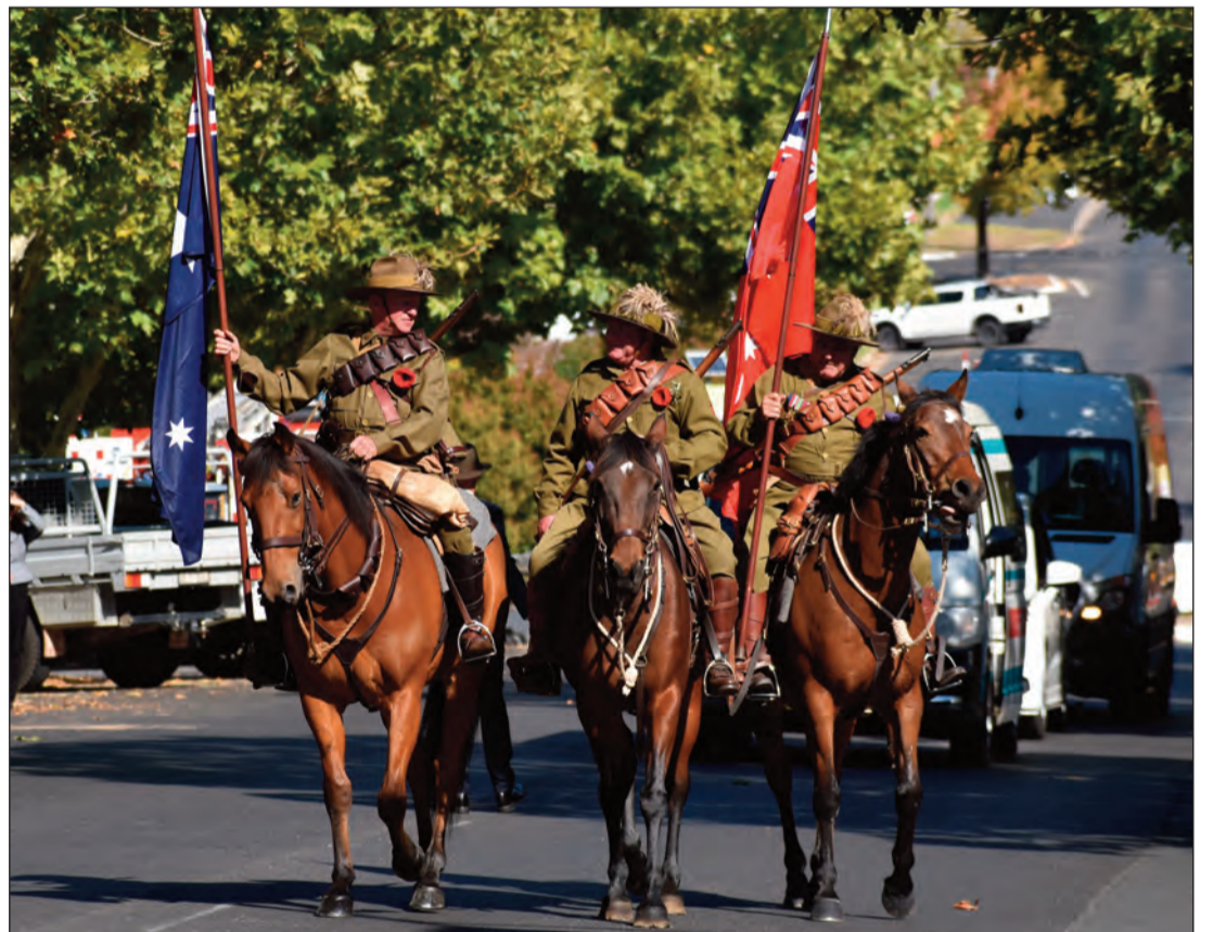
Lighthorsemen led last year's ANZAC Day parade.