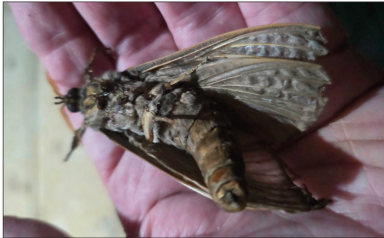
A rain moth which has turned up in a local Bogong moth citizen science project.