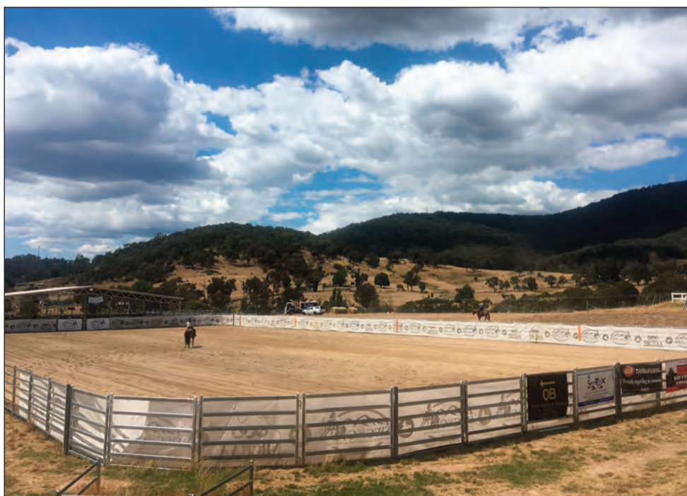
The main arena against the backdrop of Mt Tumbarumba. The centre has quickly gained a reputation as a world class events facility.

This service is supported by funding from firsthealth Limited and Murrumbidgee Primary Health Network through the Australian Government's PHN program.