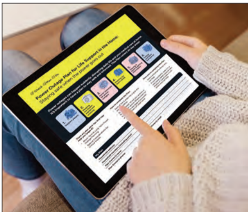
Online resources now available to help people plan ahead for power outages.

A practical planning resource supporting people during power outages who rely on medical equipment across Australia