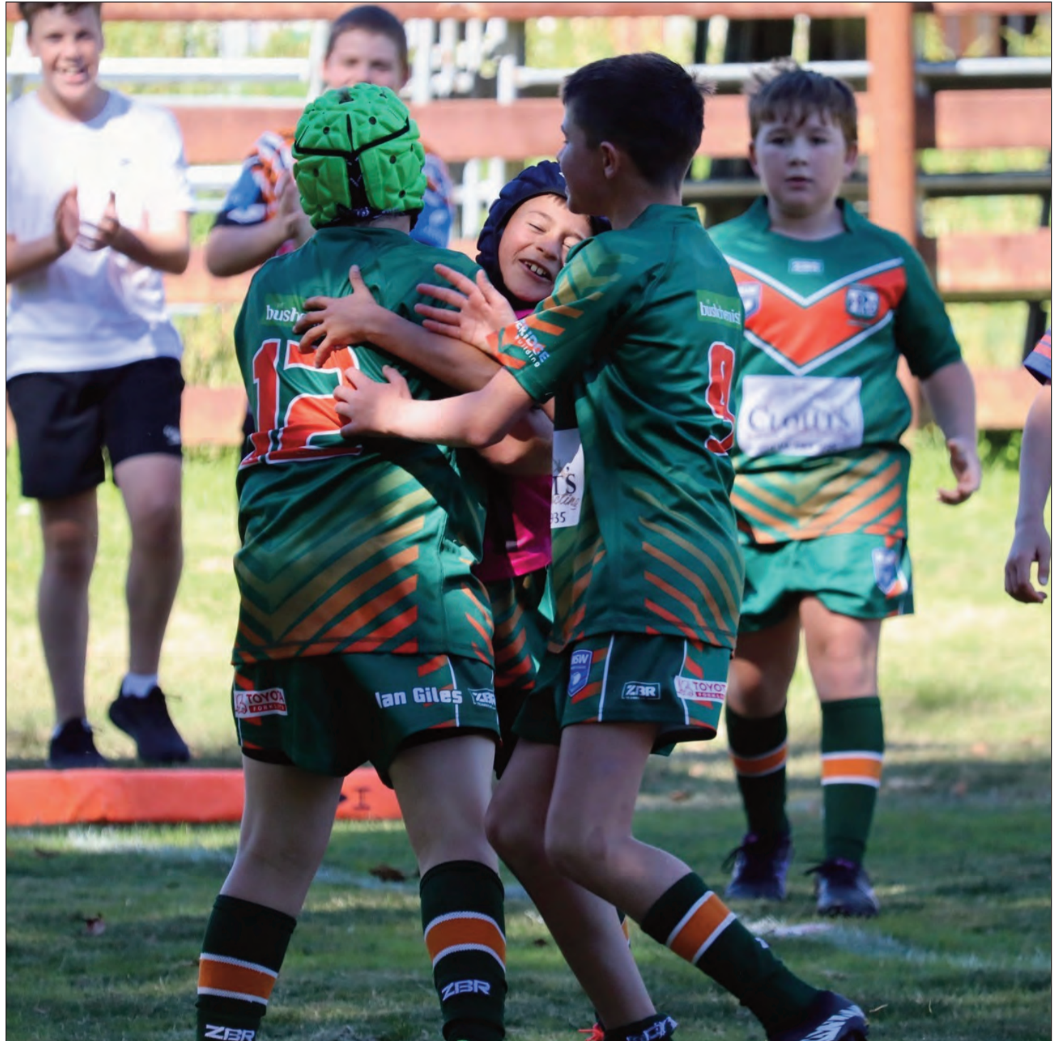
Tumbarumba Batlow Greens Under 12 celebrate a try against Wagga Roos in the opening round of season 2026.

A big effort from all players, with everyone contributing and supporting each