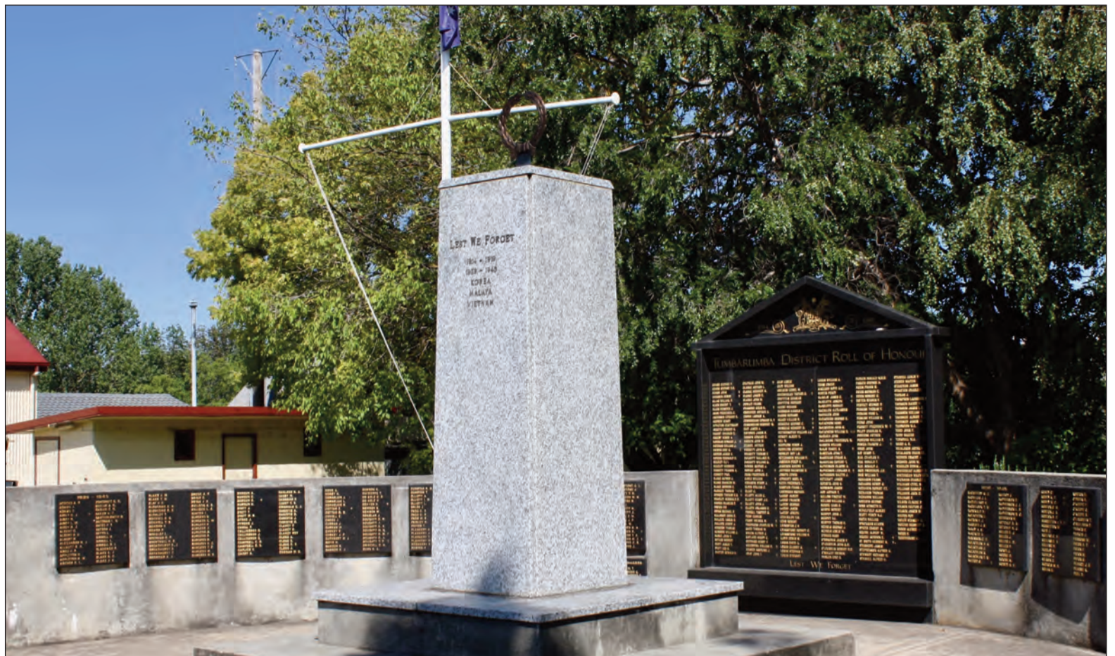
Tumbarumba cenotaph will be the site of remembrance on ANZAC Day this Saturday.

At around 10.20am the march will begin to form up and will march off at 10.30am returning to the cenotaph so that the main service can begin at 11am. All ser-