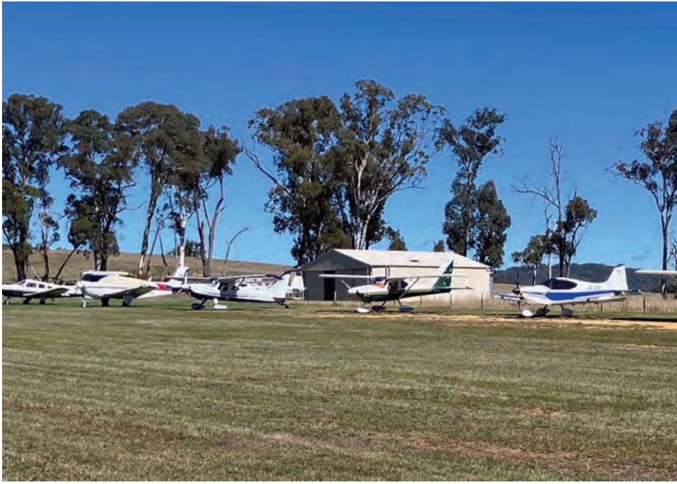
Tumbarumba Aero Club hosted a fly in of ten planes in March.